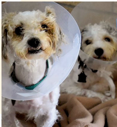
After being groomed, these sweet dogs felt much happier and more comfortable right away. All have since been adopted!

Our staff responded to the scene to assist with documentation and removal of 7 animals from an apartment in Union County, all of whom needed to be sedated to remove severe matting of their coats. Dental work and medicine for skin irritation were also needed to get these pups back into top shape and ready for adoption.