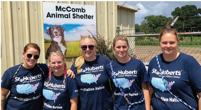
St. Hubert's staff visit one of our long-time source partners in Mississippi, bringing needed enrichment supplies for their shelter pets.

In two short years, 8,300 animals (and counting) have been served through our Sister Shelter WayStation Program! With the support of PetSmart Charities, St. Hubert's coordinates the relocation of animals from overburdened, underserved areas of the country to shelters in the Northeast with space and potential adopters. Our Give Back component of the program continues to grow as well, having sent back more than $280,000 in funds for spay/neuter to end the shelter overpopulation crisis at the root in source communities.