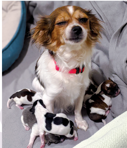
Mom and pups have all been adopted.